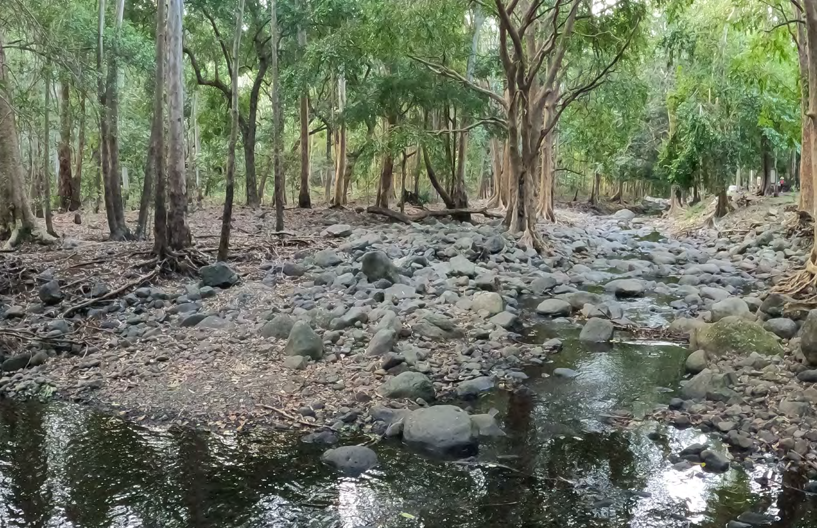
3 - Black River Gorges National Park, it is located in the southwest of Mauritius.