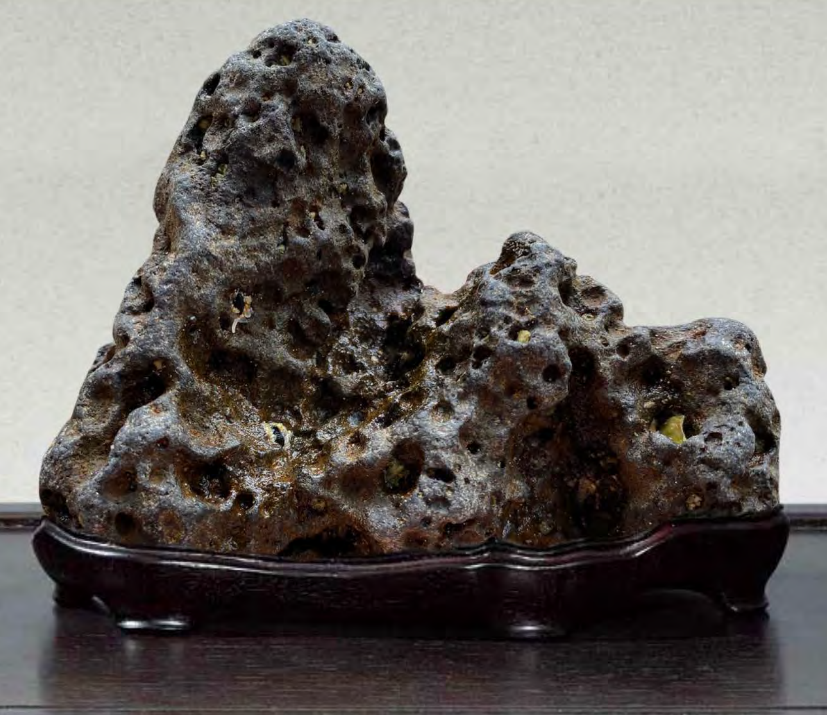
This is a virtual daiza